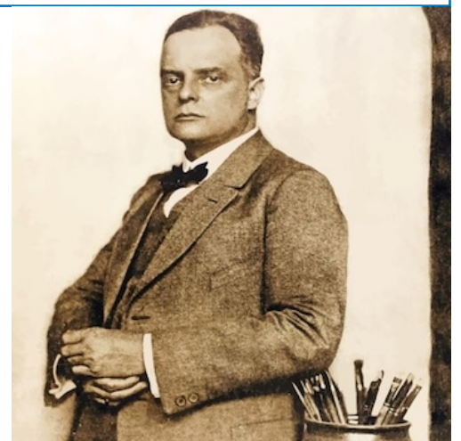
Paul Klee - abstract artist